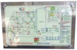
Fire Escape Route Plan