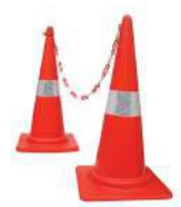
Traffic Cone & Chain