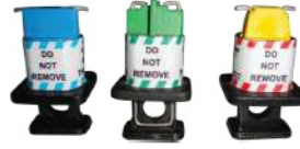
Pin in & Pin out