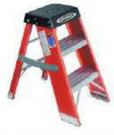
Industrial Step Ladder