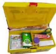
Snake Bite Kit