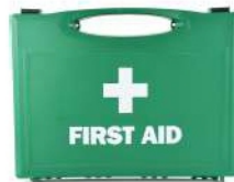
PVC First Aid Box