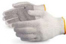
Cotton Knitted Gloves