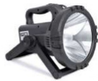
Search Light with Stand