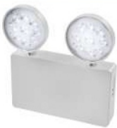
Twin Spot Beam Light