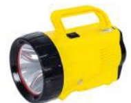
Rechargeable Search Light