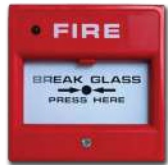
Manual Call Point