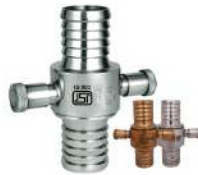
Male Female Coupling