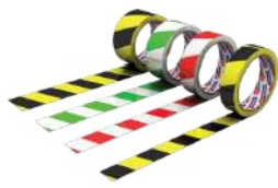
Floor Marking Tape