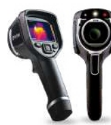
Thermal Imaging Camera