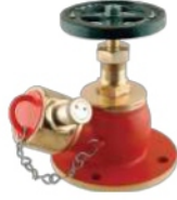
Single Headed Hydrant Valve