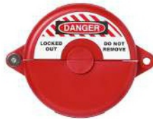
Gate Valve Lockout