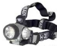
Helmet Mounted Torch