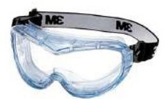
3M 40605 Fahrenheit Goggle