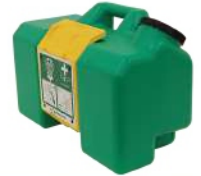
Portable Eye Wash Station