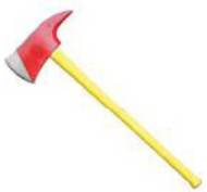
Fire Man Axe