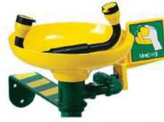
Wall Mounted Eye Wash Shower