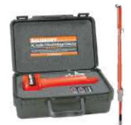
Voltage Detector Kit