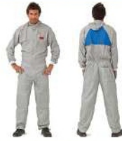
3M 50425 Reusable Coverall Suit