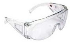
3M 11850 Virtua IN HC