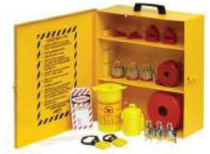
Lockout Tagout Station