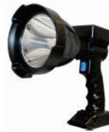
Handheld Search Light