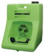
Fendall Eye Wash Station