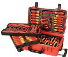
Insulated Tool Kit