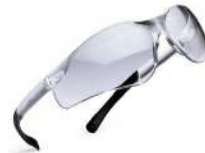
UD-81 Safety Goggle