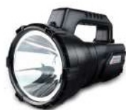
Dragon Search Light