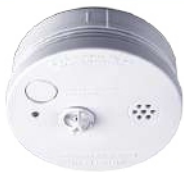
Stand Alone Smoke Detector