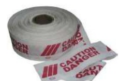
Caution Barricade Tape