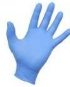
Thin Nitrile Gloves