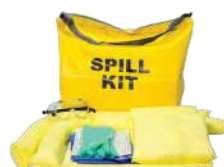
Spill Kit Chemical & Oil