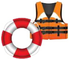
Life Jacket & Lifebuoy