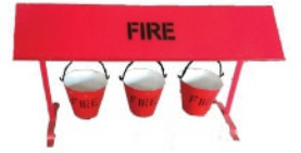
Fire Bucket & Stand with Canopy