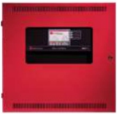
Fire Alarm Control Panel