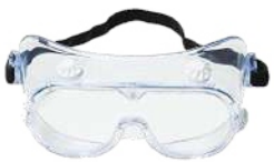
3M 1621 Splash Goggle