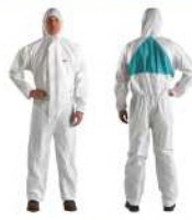
3M 4520 Disposable Coverall Suit