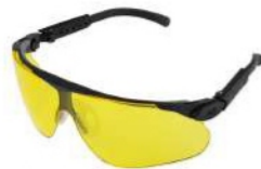
3M 13228 Maxim Amber Lens