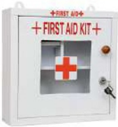
Metallic First Aid Box