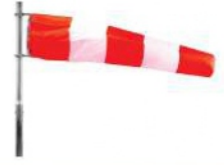
Wind Sock With Pole