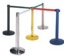
Q Management System