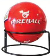
Fire Ball Extinguisher