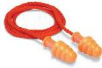
Ear Plug 3M 1110