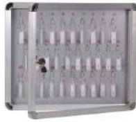
Key Holding Box