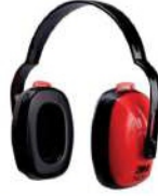
Ear Muff 3M 1426