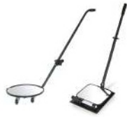
Under Vehicle Inspection Mirror