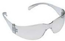
3M 11880 Anti Fog